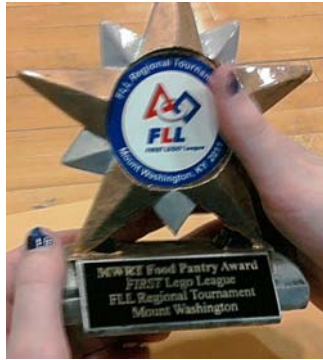
Figure 3: Community Service Team Award