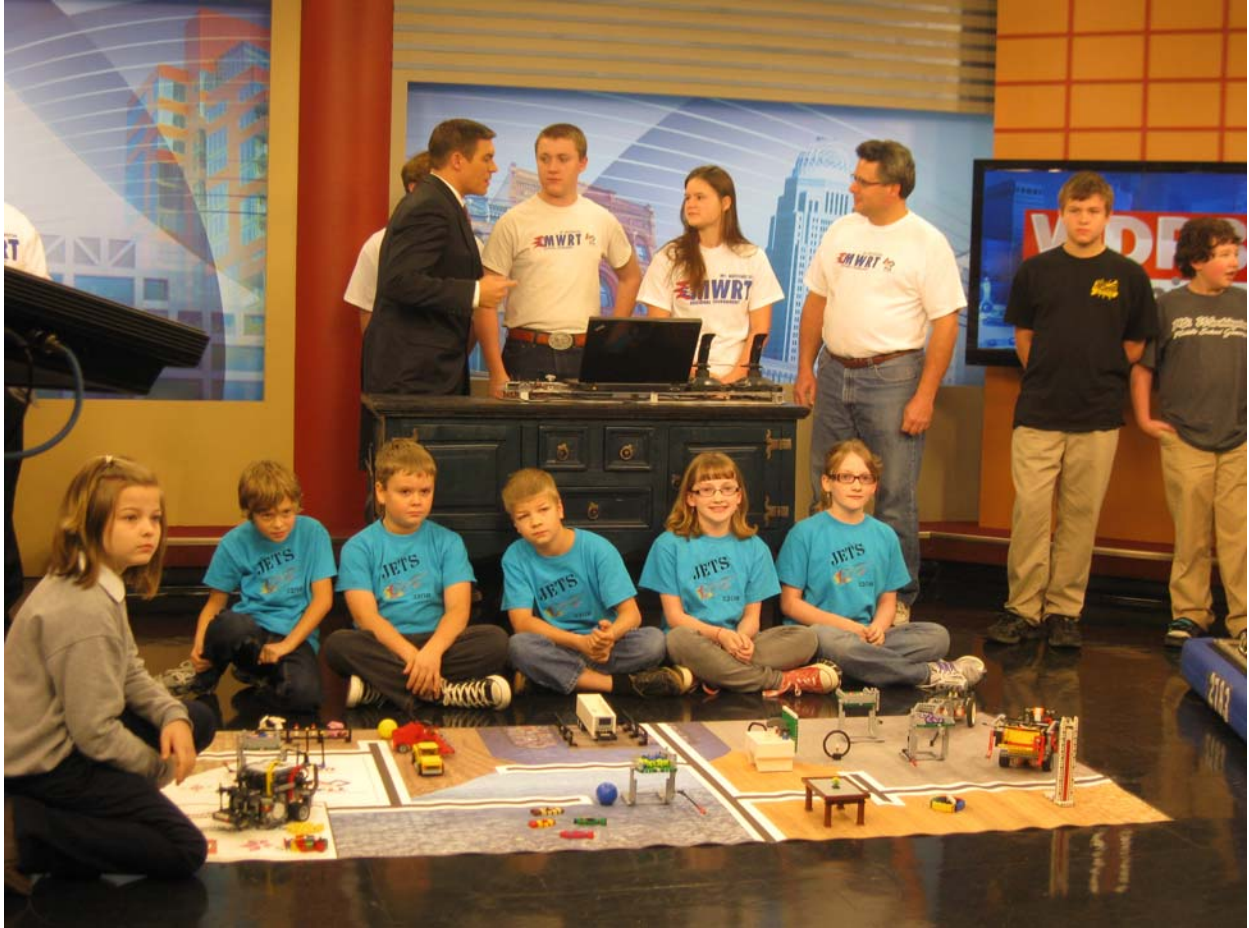
Figure 6: Jets on Local Television Show Promoting the Tournament