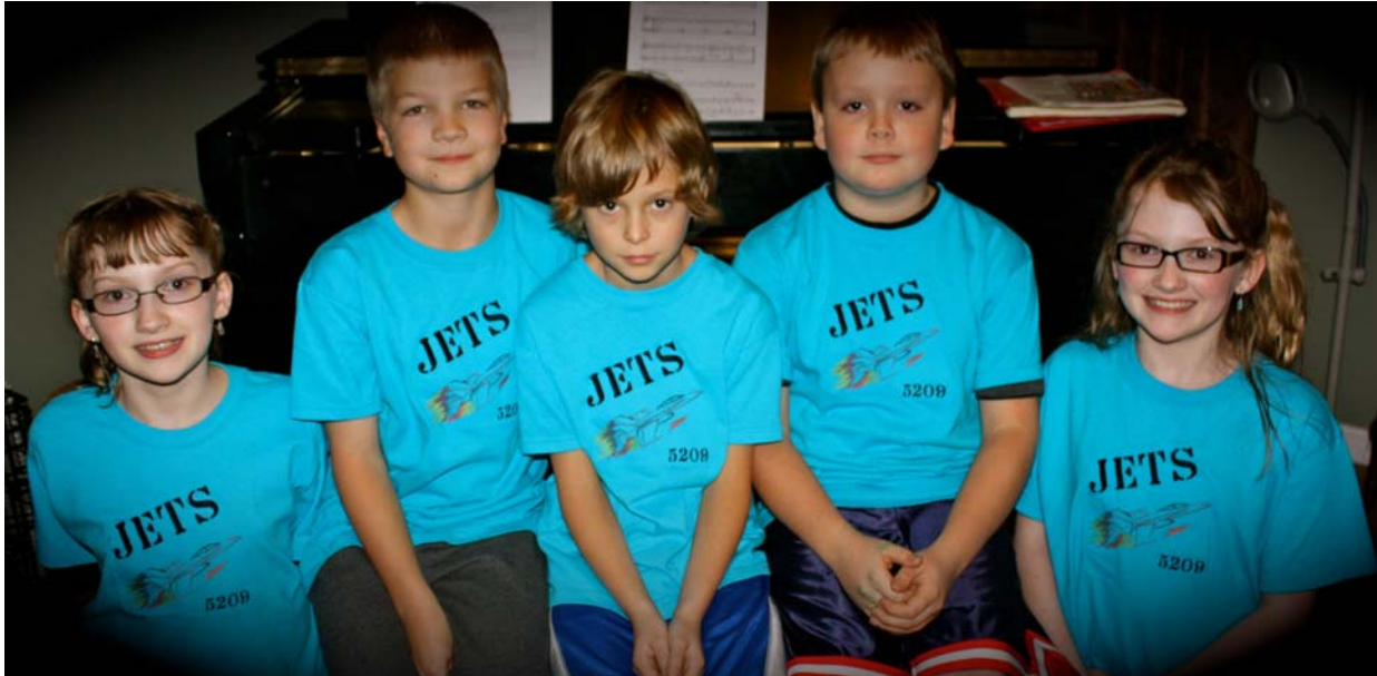
Figure 7: Group Photo