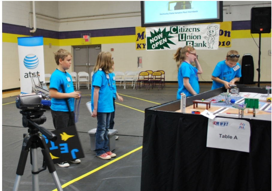
Figure 4: Jets in Action