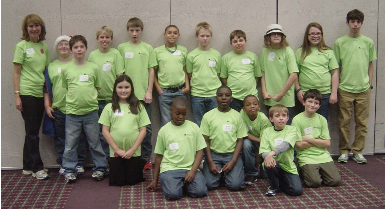
Figure 1: Members from all Three Teams.