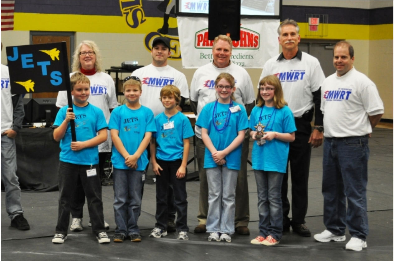
Figure 8: Trophy Time!