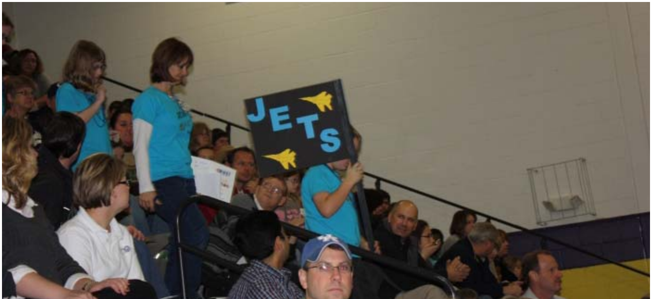
Figure 5: Team Parade