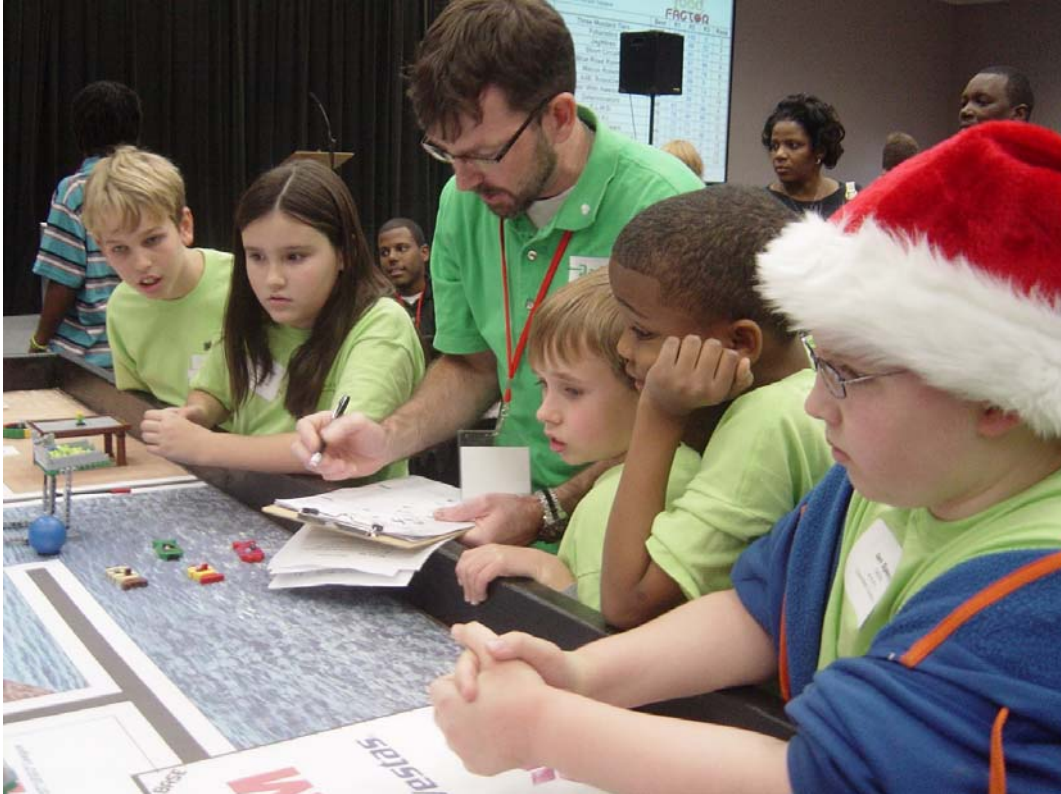
Figure 2: Team A. I. Getting Scores from the Judge at the Competition